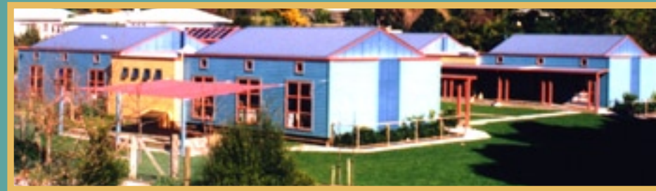
Dorset Avenue Junior School