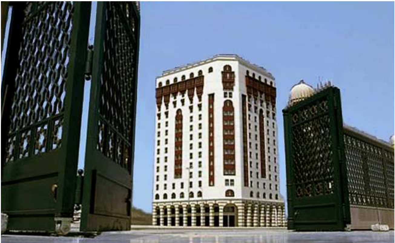
View from the room of Hotel Elaf Taiba