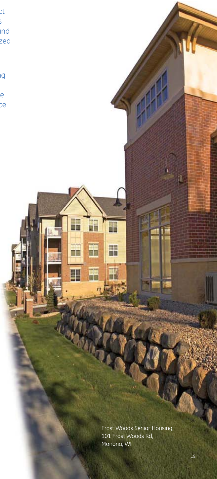
Frost Woods Senior Housing, 101 Frost Woods Rd, Monona, WI