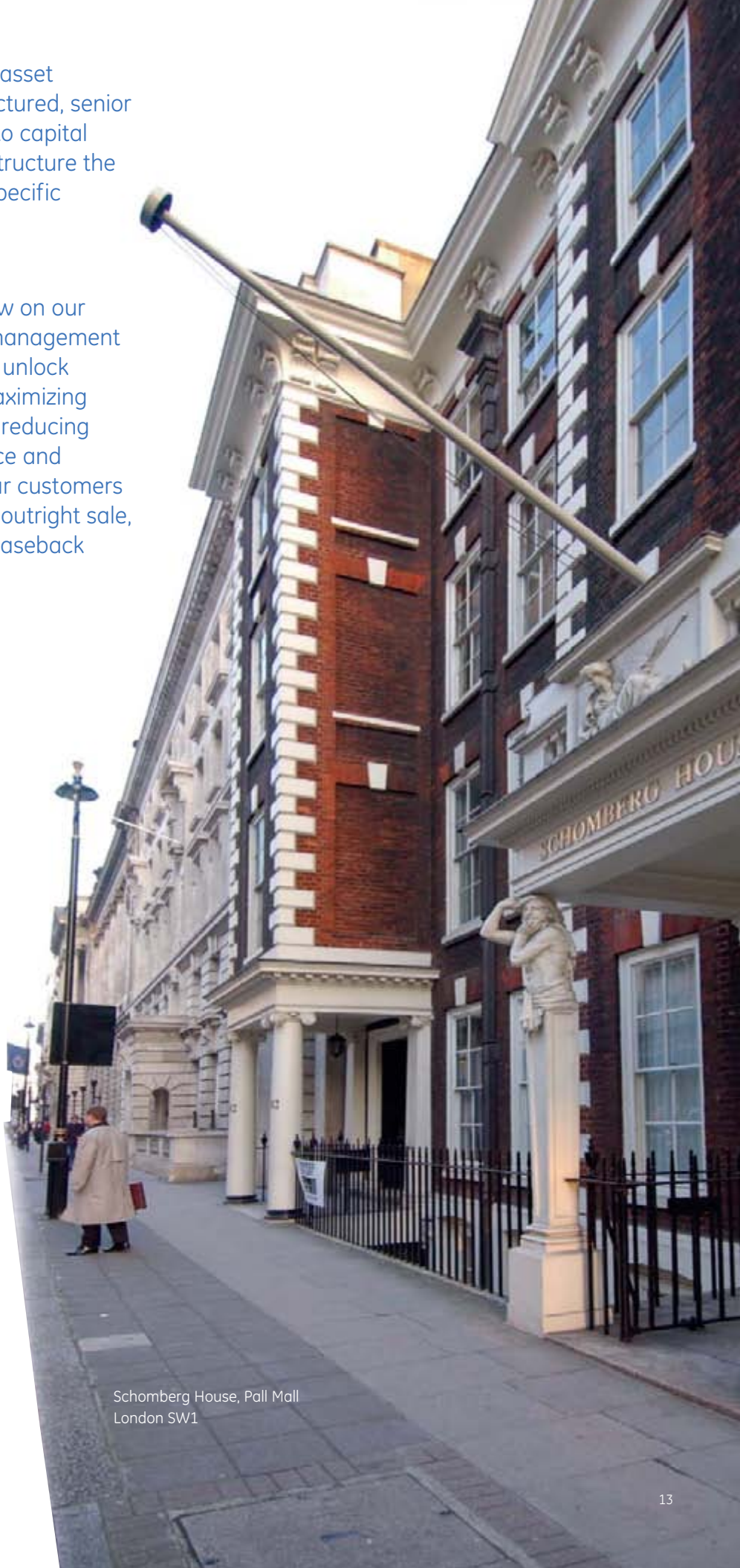
Schomberg House, Pall Mall London SW1

Our corporate property solutions draw on our local market knowledge, global risk management and financial structuring expertise to unlock the potential of real estate assets, maximizing returns from their balance sheet and reducing management costs. We provide advice and flexible financial structures to help our customers achieve their goals, whether through outright sale, outsourcing, or innovative sale and leaseback agreements.